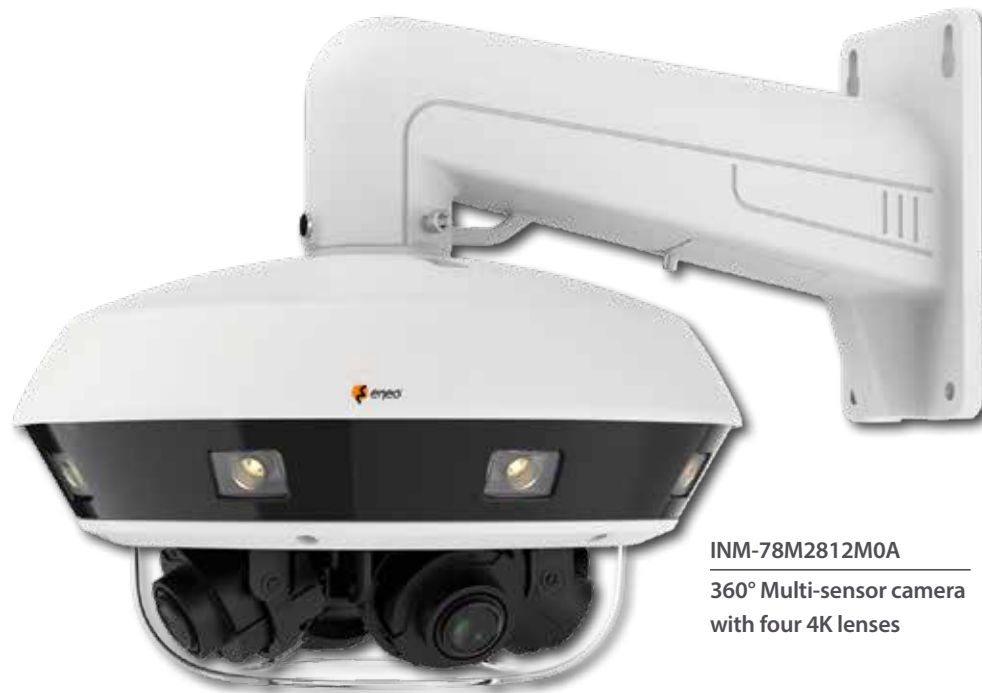
INM-78M2812M0A 360° Multi-sensor camera with four 4K lenses