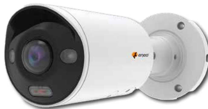
INB-58F0002M0PA Panoramic camera for monitoring large areas