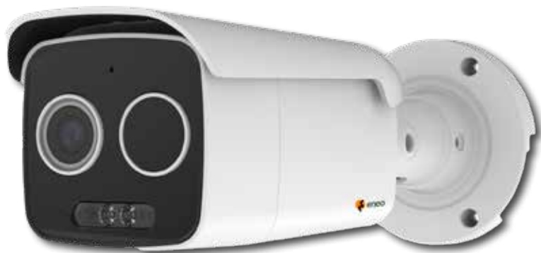
INT-8SF0003M0A Hybrid camera with optical and thermal imaging sensor