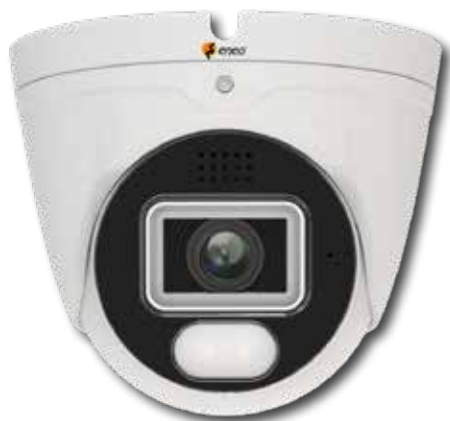
IND-58F0028MTLA Turret camera for excellent Low Light performance